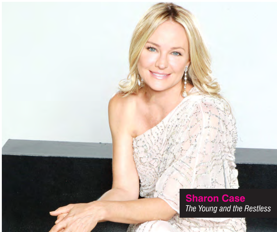
Sharon Case The Young and the Restless

(800) 237-9851 or email: sales@russelljohns.com