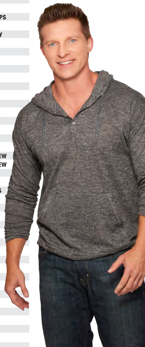
Steve Burton General Hospital